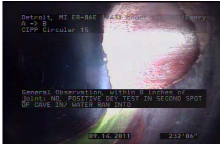
Positive Dye Test from Private Connection to 19412 St. Louis