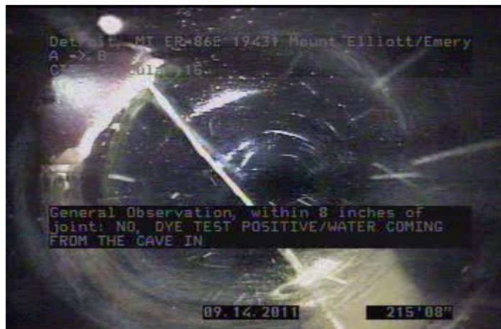
Positive Dye Test from Connection to 19431 Mt. Elliott