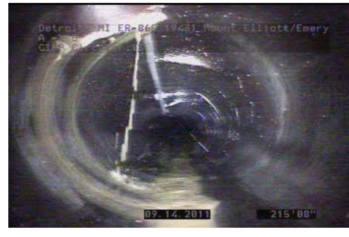
Capped Service in Line with Property at 19431 Mt. Elliott

Summary of Sinkhole Investigation (2011): The sinkhole was called in 2011 and reported to be behind the property at 19431 Mt. Elliott. Dye Test conducted in the sinkhole was positive through a capped connection which lined up with the property on the Mt. Elliott side of the alleyway at 19431 Mt. Elliott. The Dye test was also positive through the private sewer connection from 19412 St. Louis. The video inspection did not show an obvious sign of defect on the private connection to 19420 St. Louis.